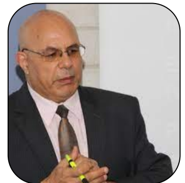
Mosad Zineldin Sweden