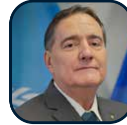
Jarbas Barbosa Director at the Pan American Health Organization, USA