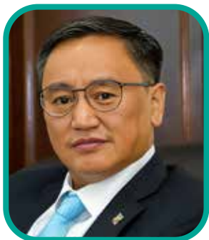
Chinburen Jigjidsuren Member of the Parliament of Mongolia, Mongolia