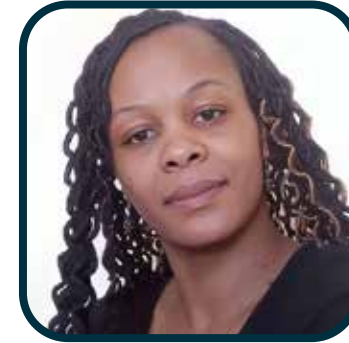
Violah Mpundu Biomedical Research Institute South Africa